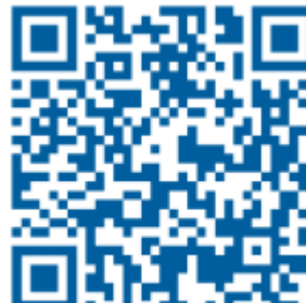
THEMATIC TRAILS OF THE REGION