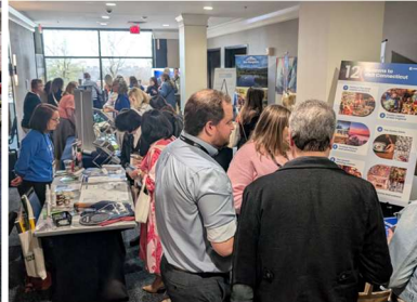
Kick Off Welcome Party