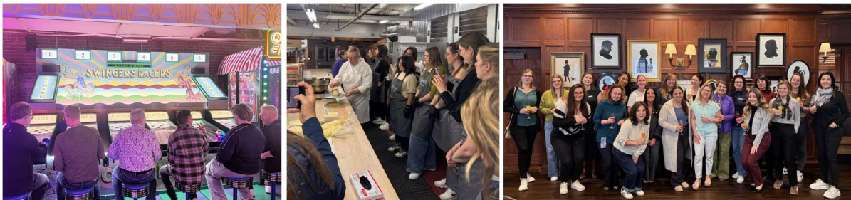
MeetBoston Pre-Summit Program

All participants were invited to a reception at Swingers Boston with golf, arcade, culinary and cocktails and to attend a Meet Boston Dinner Party at the Museum of Fine Arts.