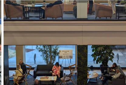
Delta Lounge in Exhibition