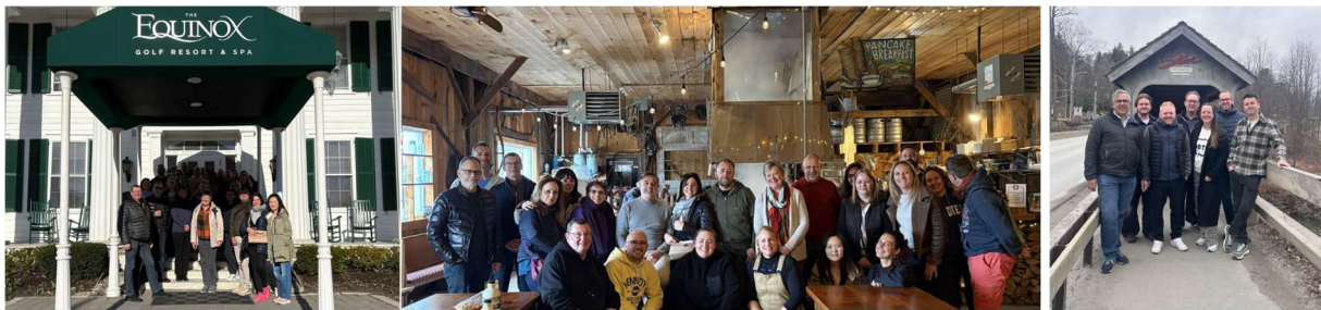
Vermont Pre-Summit Program